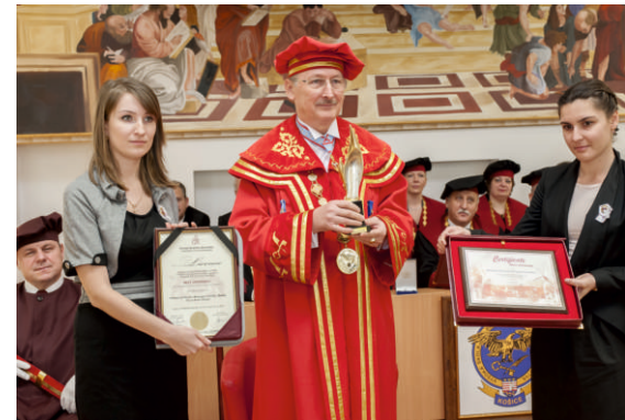
award for Best University and Manager of the year, EBA Oxford

April 2018 : „The Platinum Technology Award for Quality & Best Trade Name“ from the association OthersWays, Berlin