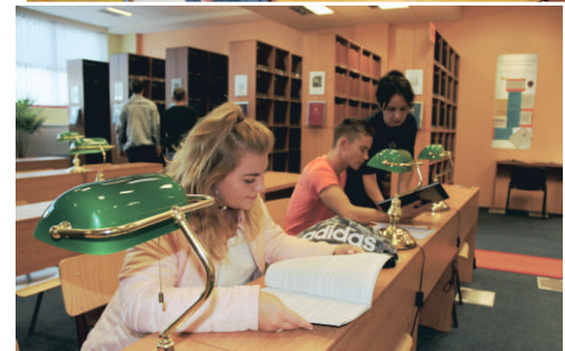
computer room and study room at the academic library