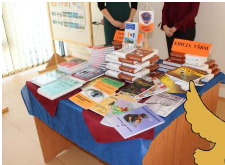
logo of USM book edition

The main goal of teaching is to direct students to the economic field using knowledge from profiling subjects. Emphasis is placed on two areas, namely transport and economic risks, which mainly affect the activities of natural and legal persons. As part of the course, students will gain in-depth knowledge of crisis economics, public and corporate finance, financial markets, logistics activities, randomness and tools that can be used to guide and eliminate risks. The profiling subjects within the department include: Protection of economic interests, Safety of transport and transport infrastructure, Financial management, Logistics, Planning and forecasting,