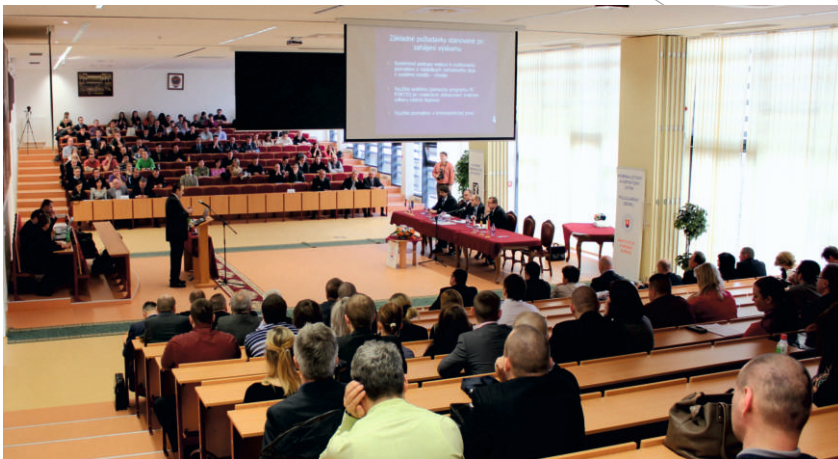
annual international scientific conference SECURE SLOVAKIA AND EUROPEAN UNION

The results of scientific activities are presented in professional journals at home and abroad, as well as at scientific conferences.