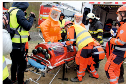
co-operation exercise of the integrated security system of the Slovak Republic in the USM training center, with the topic of the discovery of a contagious disease in a traffic accident