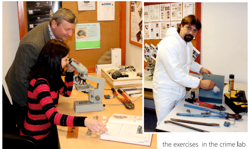
the exercises in the crime lab

A specific area is forensics, private security services, terrorism and extremism, but also weapons and explosives theory, European security, information security, environmental security, aviation security, economic security and many other areas of security. Great attention is paid to the issue of prevention, not only of crime, but also of other negative phenomena.