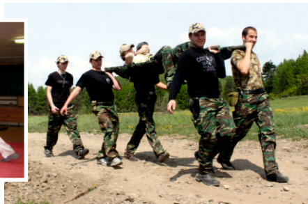
survival course at the USM training center, self-defense courses