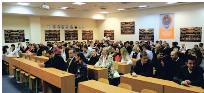
students during lectures

The role of sociological subjects such as Sociology Crisis communication, etc. students in these fields are needed to be able to prevent conflicts, anticipate them or resolve specific situations, especially in the field